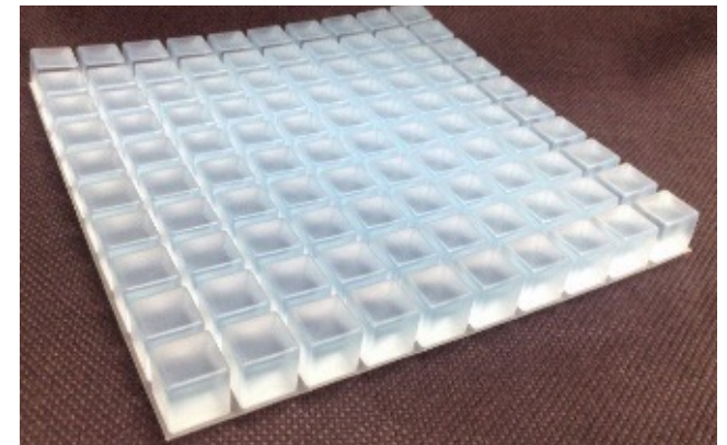
Material for pressure ulcer prevention mats